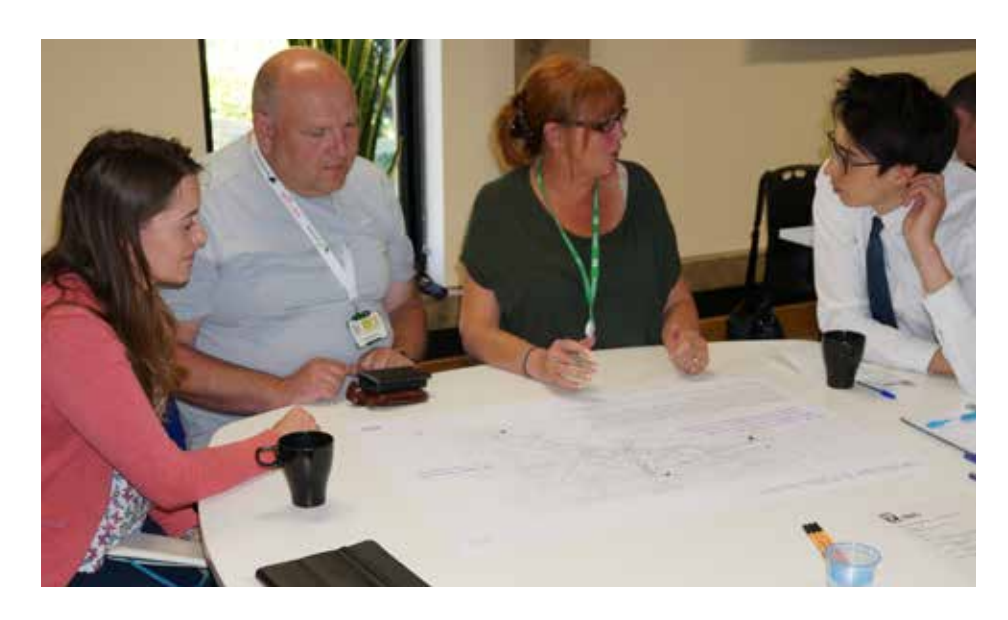
Workshop groups discussed the impact of different building heights and urban forms across the study area.

The London Road and A414 junction could be made smaller to allow pedestrians and cyclists priority of access. Links off and onto the surrounding canal towpaths also need to be made more frequent. The north east corner of the junction could accommodate significant new development in the form of an attractive gateway or possibly provide for development to enable open views form properties onto the water. Housing development areas south of the junction need to be of high quality design whilst still providing for practical, industrial space too. All development opportunities in these two areas should encourage green roofs and sustainable design and construction.