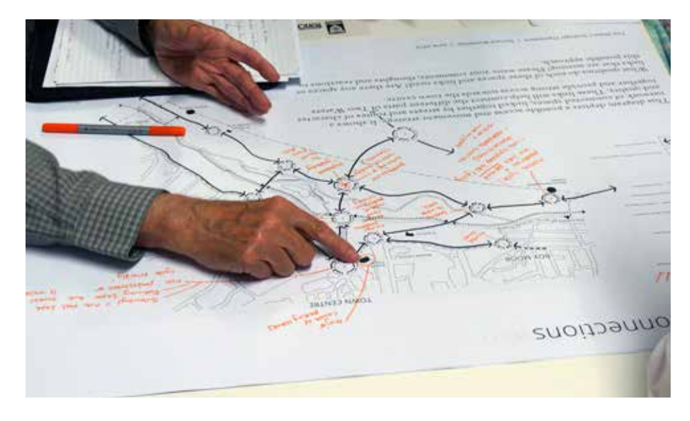
Workshop groups debated the best way to tackle access and movement issues across the study area.

The Sainsbury's roundabout attracts queues of traffic from further up along London Road and these congestions have a detrimental effect upon the area.