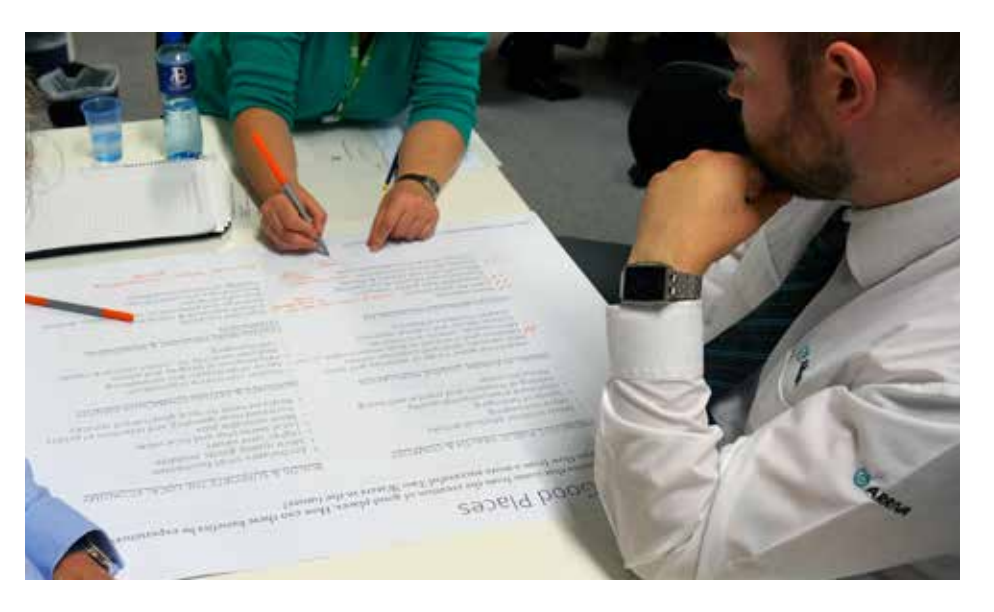
Workshop groups identified the benefits of good planning.

<u>Summary</u> An increase in ease of accessibility will improve the enjoyment of footpaths and open spaces through more frequent use. Different areas within Two Waters should become more walkable and have greater interconnecting qualities. It will provide safer environments for pedestrians and cyclists and should be compatible with public transport.