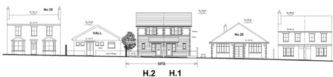
FRONT ELEVATION To Longfield Road ( NW ) : PROPOSED