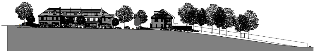
Zone B Elevations H.3 - H.9 / Zone E Flank Elevation H.35 / Access Road down to Aylesbury Road