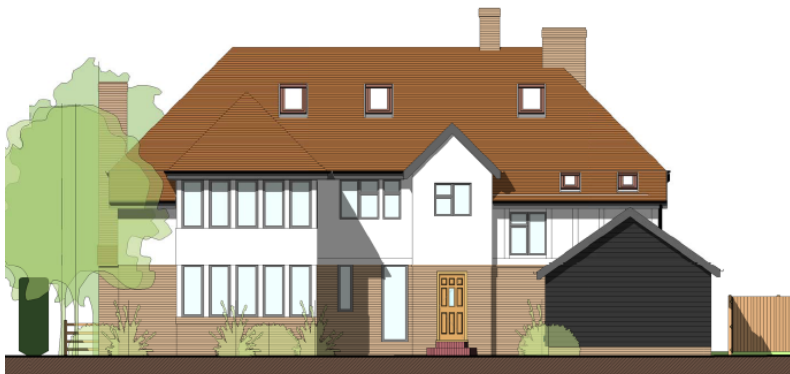
Proposed North East Elevation showing car port 1:100

KINGSMEAD, KINGS LANE, CHIPPERFIELD, KINGS LANGLEY, WD4 9EN