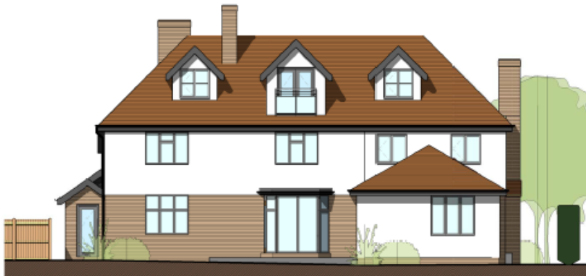
Proposed South-West Elevation 1:100