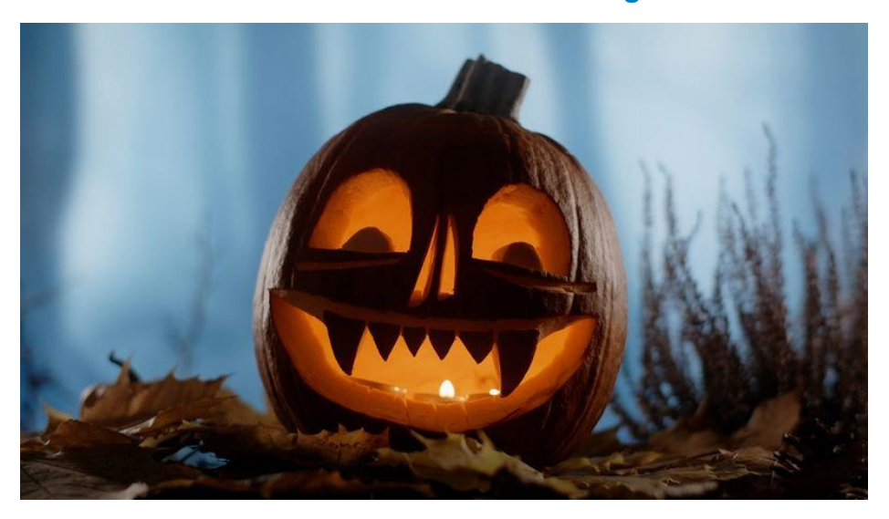
Planning to go trick or treating this Halloween?

If so, Hertfordshire Constabulary is asking people to please consider the following advice to help you stay safe and prevent distress being caused to others: