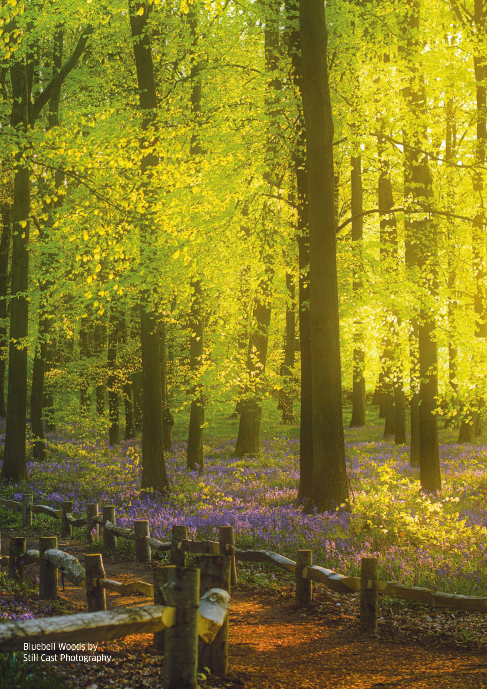
Bluebell Woods by Still Cast Photography.