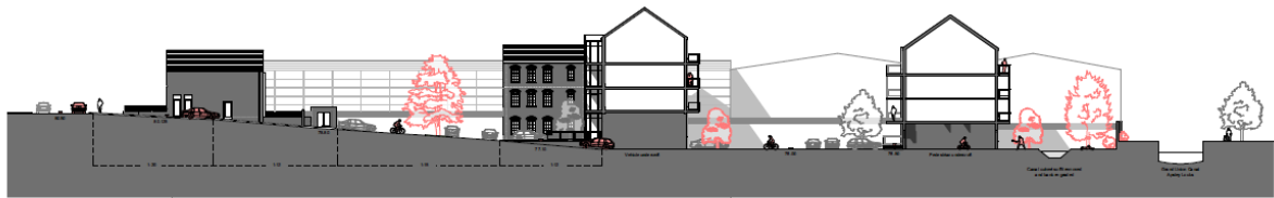
Site Section A-A 1:200

LAND ADJ APSLEY MILL COTTAGE, STATIONERS PLACE, APSLEY, HEMEL HEMPSTEAD, HP3 9RH