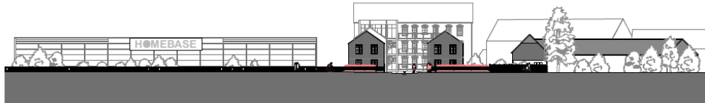
London Road Street Elevation 1:200