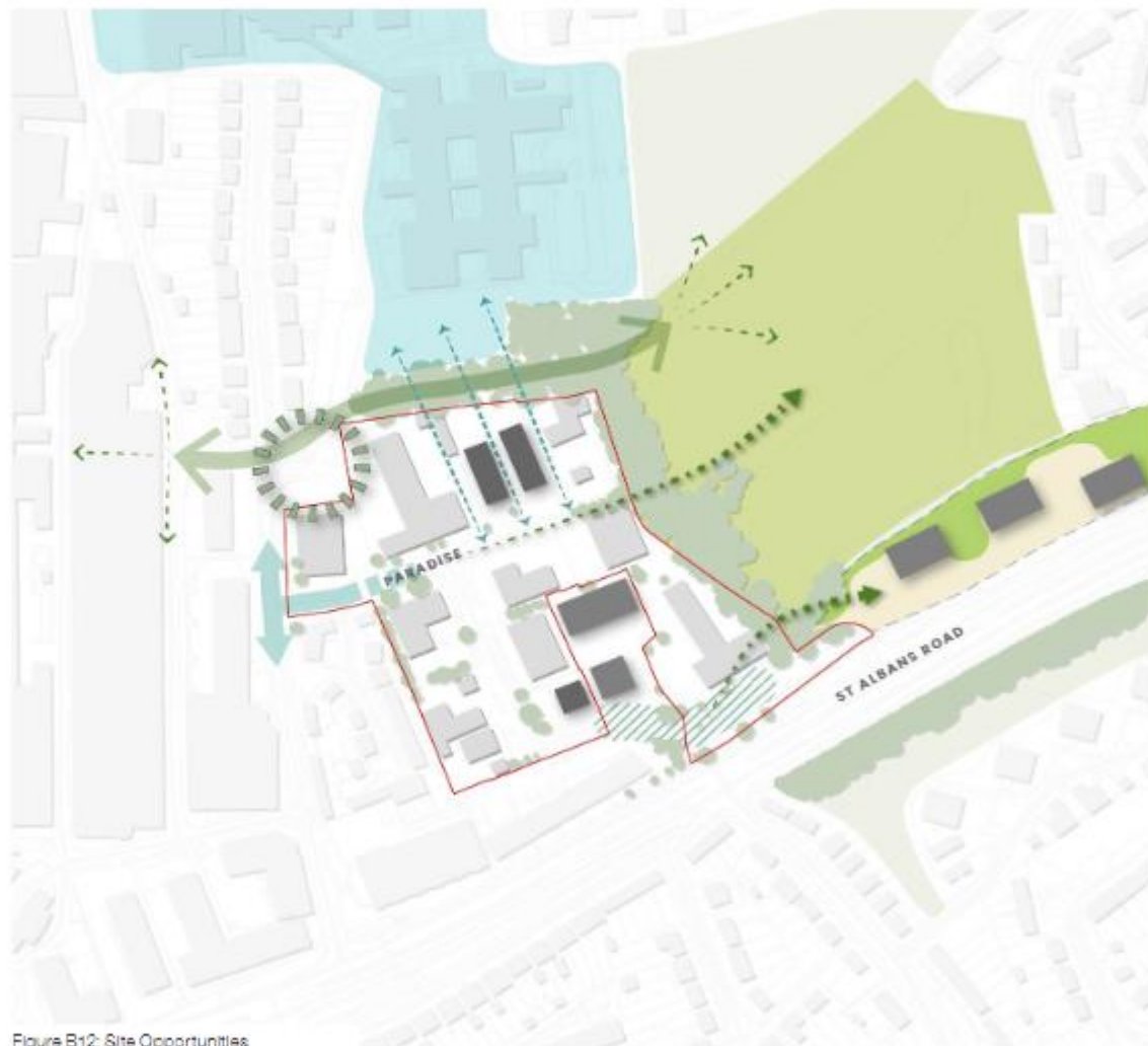
Figure B12: Site Opportunities