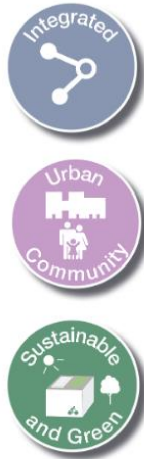
Figure 2.1: Three key priorities for Paradise