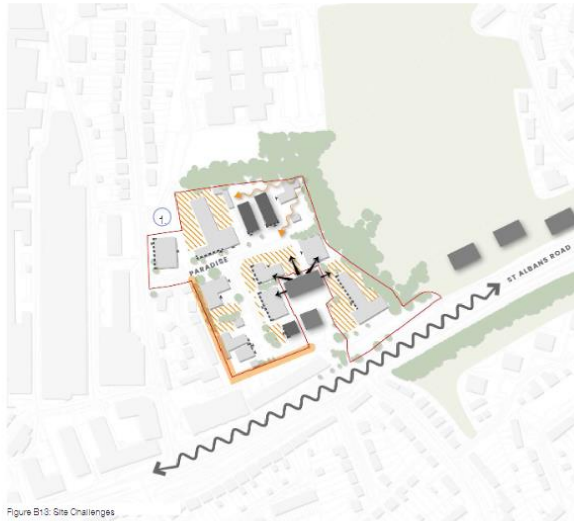
Figure B13: Site Challenges