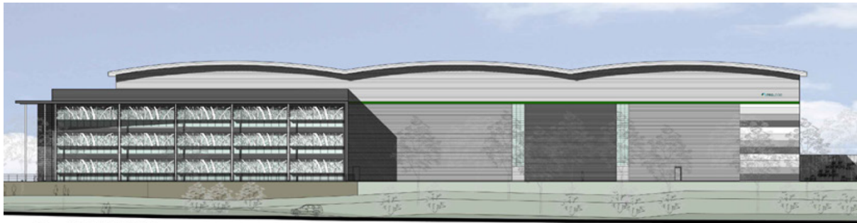
03 102 SOUTH ELEVATION 1:200

LAND AT MAYLANDS AVENUE, HEMEL HEMPSTEAD, HP2 4NW