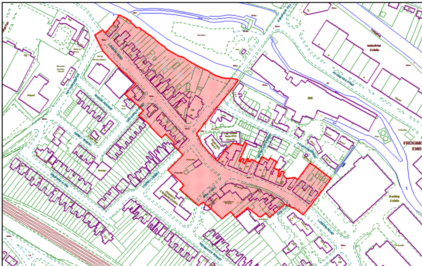
Figure 4 – AQMA 2 London Road, Apsley