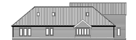
Side Elevation Plot C (SW)