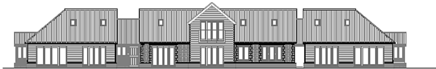
Rear Elevation (SE)

HAZEL CORNER DOG HOTEL, WINDMILL ROAD, MARKYATE, AL3 8LP