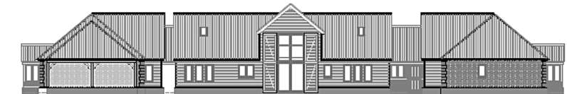
Front Elevation (NW)