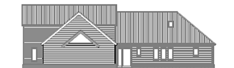
Elevation on B.S.