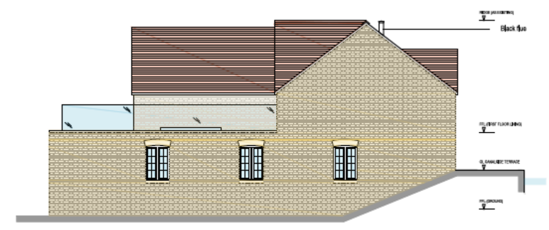
SIDE (EAST) ELEVATION