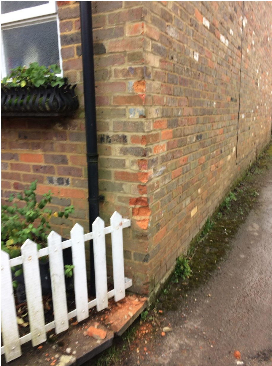
14 Trowley Hill rd