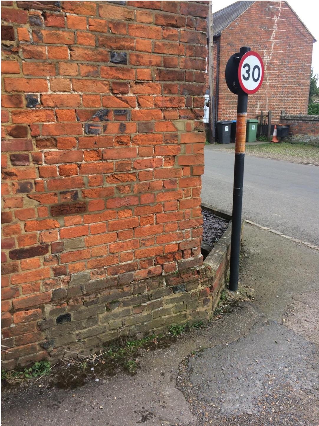
12 Trowley Hill Road- listed building- existing damage.