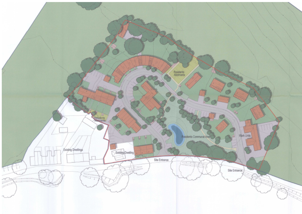
Site Layout Plan

ITEM NO: 5.2 4/01352/11/MFA FORMER EGG PACKING FACILITY, LUKES LANE, GUBBLECOTE, TRING, HP23 4QH Case Officer – Joan Reid