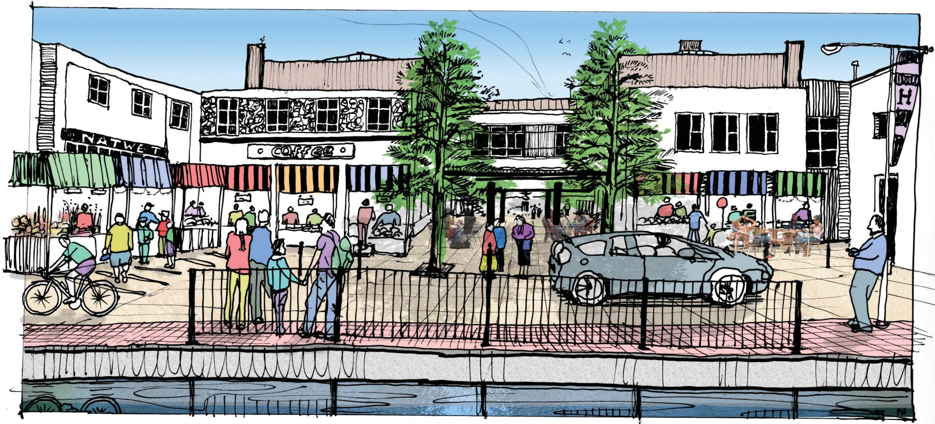
BANK COURT PLAZA LOOKING EAST FROM WATER GARDENS