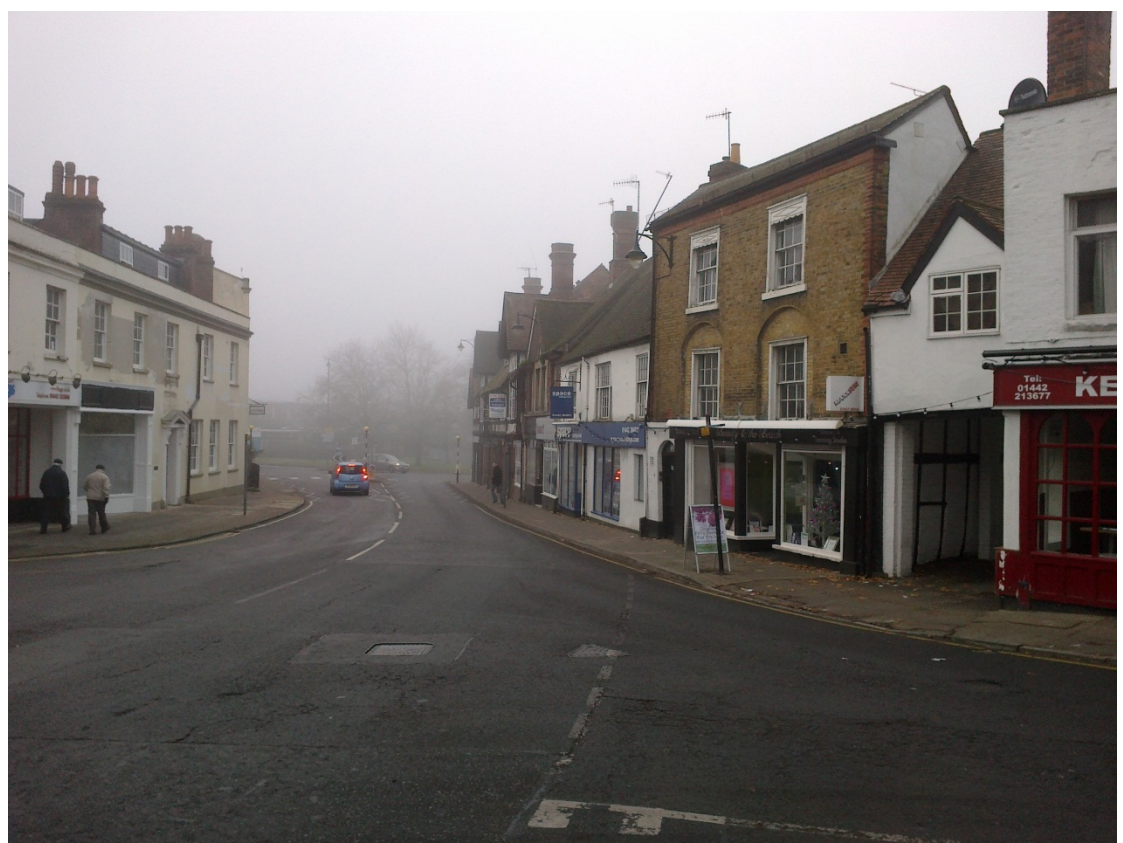
Looking south-west from premises, along Queensway