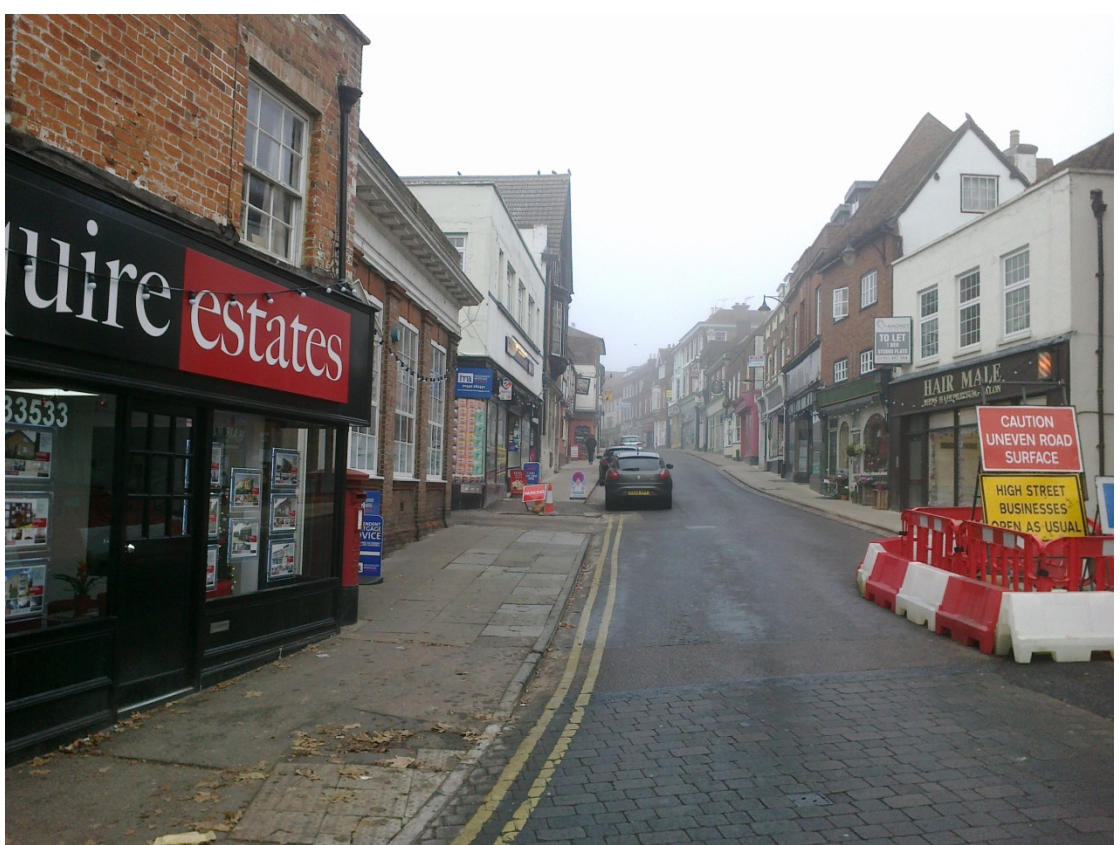
Looking north from premises, along High Street