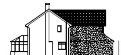
Side Elevation (Scale 1/100)