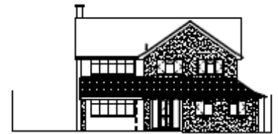
Front Elevation (Scale 1/100)