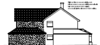
Side Elevation (Scale 1/100)