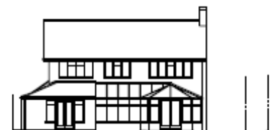
Rear Elevation (Scale 1/100)